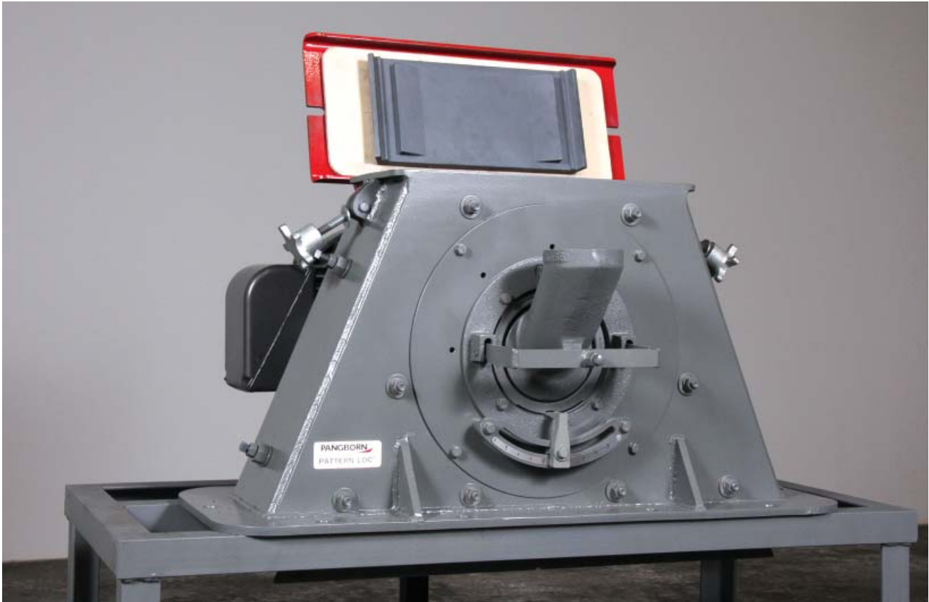
New features of the Genesis wheel shorten the time needed for removing "shot locked" vanes

heavy lid in the open position while maintenance is being performed. Other safety improvements include an integral U-shaped feed spout clamp, and the rapid release vanes discussed above.