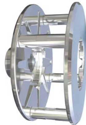
Dual Runnerhead for Pangborn's new Genesis wheel